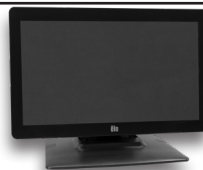
MC-D15 I MC-D15 II