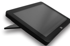
MC-D10 I MC-D10 II