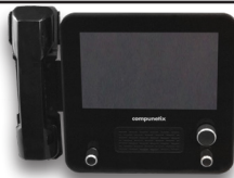
MC-D8 I MC-D8 II